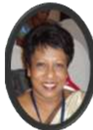
Genie ACB ALB