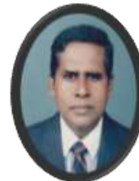
Ratnasiri ACB. CL